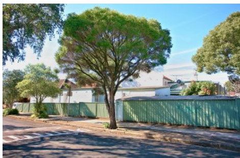
36 Surrey Street, Marrickville